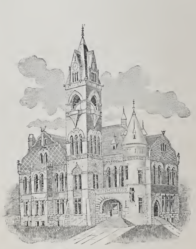
FORSYTH COUNTY COURT HOUSE.

EACH MEMBER OF THE 10TH CAVALRY has agreed to make a personal contribution to the "memorial."